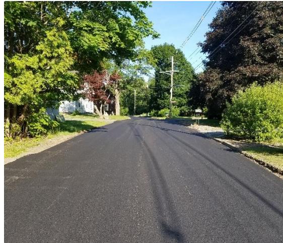
Figure 1 - Richardson Road

The bottom pavement layer (binder course) was laid down on the new base and the final layer (wearing course) will be laid down the week of July 8 th following the holiday week. PJ Albert is the contractor and the total cost will be approximately $130,000 paid from the Chapter 90 (state) funds.